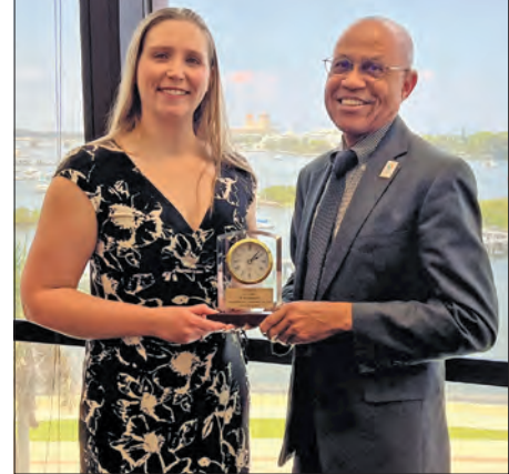
PEOPLE ARE PEOPLE PHOTOGRAPHY