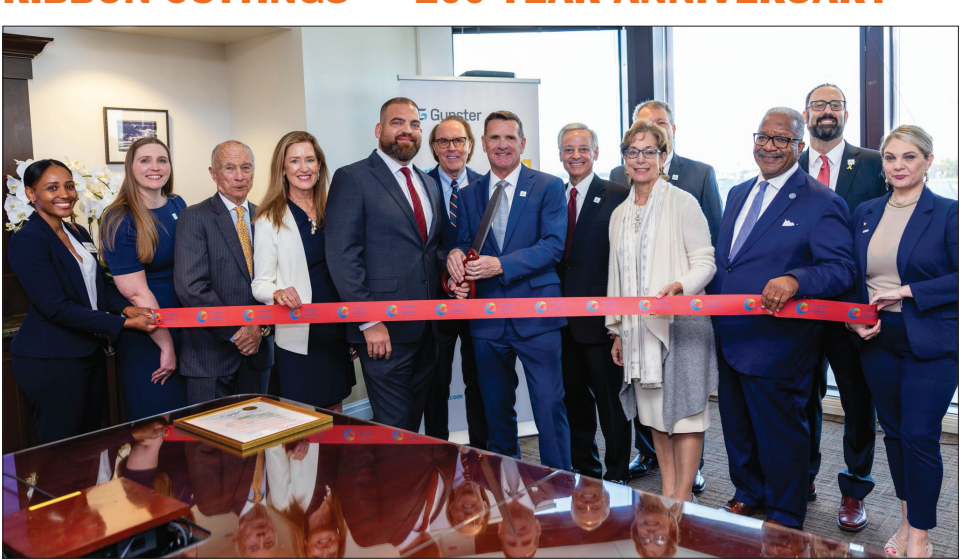
Gunster's 100th anniversary celebration commemorates a century of service. Congratulation to the entire Gunster team.